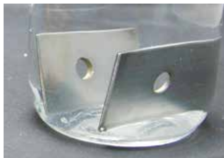
Demineralised water + DIAPROSIM™ RD25 at 50 L / m 3

ALM INTERNATIONAL DISTRIBUTES ITS RANGE OF PRODUCTS